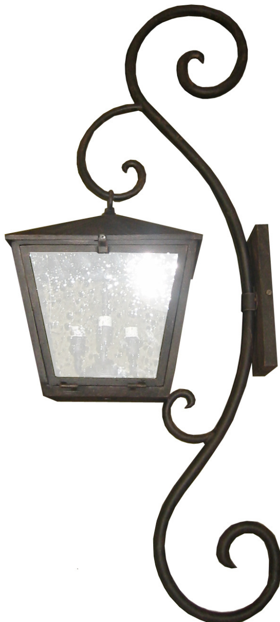
#173-mb3-ir-w-ba ~ Revival Lantern iron lantern shown with seeded glass Blackened rustic Finish 10" wide ~ Custom Sizes & Materials Available

Agoura Hills Newport Beach Dealers Nationwide US & Canada 818. 597. 9494 t EcoCA@adgmail.com www.ArchitecturalDetailGroup.com www.GreenHotelLighting.com www.adgLighting.com